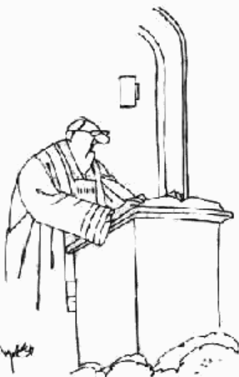
"For those of you who doze through today's sermon, you can find it on our Web site."

COMBINED WORSHIP SERVICE October 13 at 10:30 am